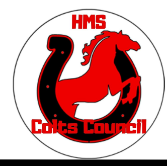
Issue #7: May 2023