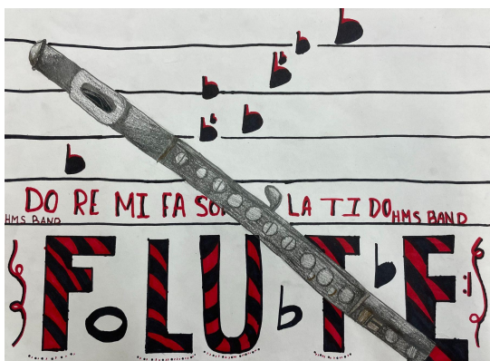
Emmalin V. 6th